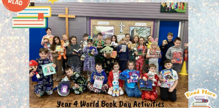
Year 4 World Book Day Activities