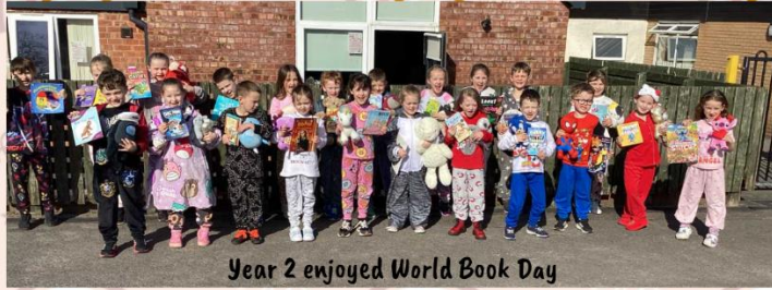
Year 2 enjoyed World Book Day